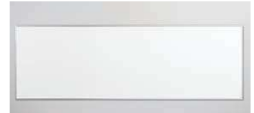
Chalkboard and Whiteboard Resurface

For installation service requests, call 1-800-328-3908 or visit 3m.com/3M/en_US/graphics-signage-us/resources/find-an-installer